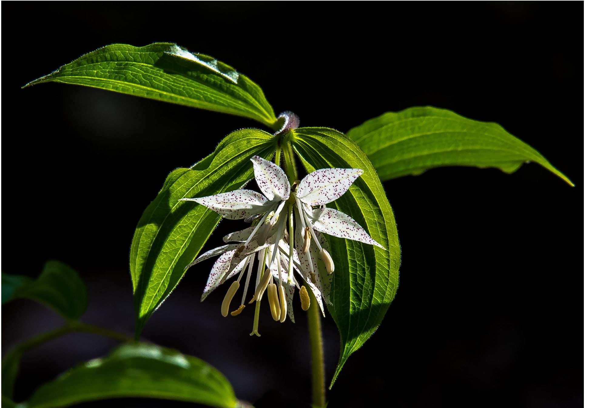
A Spotted Mandarin