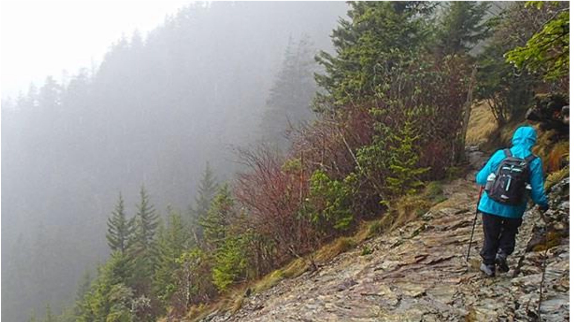
Climbing up to Shuckstack Fire Tower from Fontana Dam on the A. T.