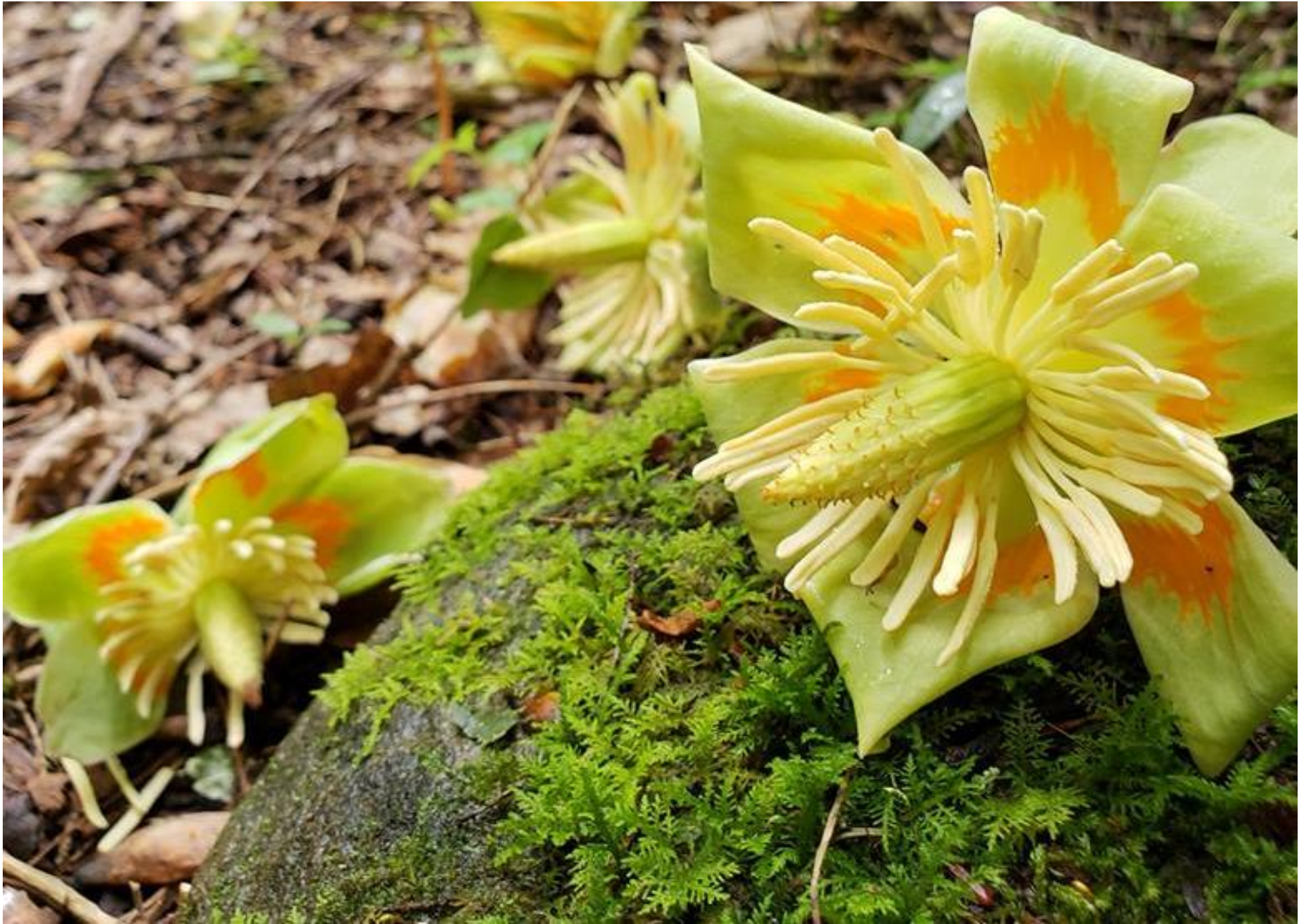
Tulip Popular Flowers Fallen to the Ground