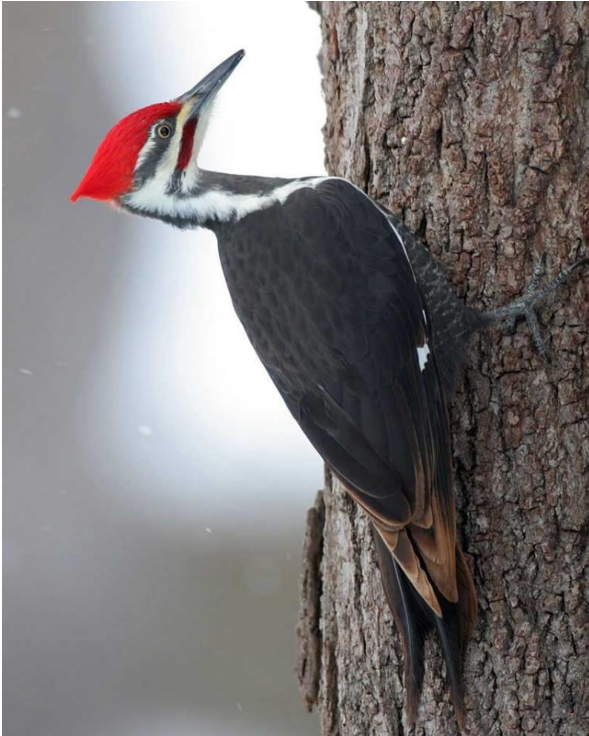
~ A Pileated Woodpecker