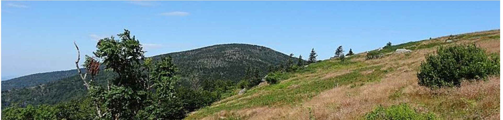
Roan Mountain from Round Bald, TN/NC

Our Whiteblaze thread, click on, "APPALACHIAN TRAIL MUSEUM UPDATES", March 13, 2019 WB #778