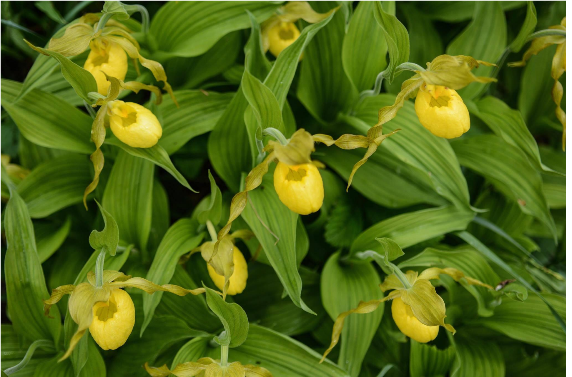
Yellow Lady Slippers