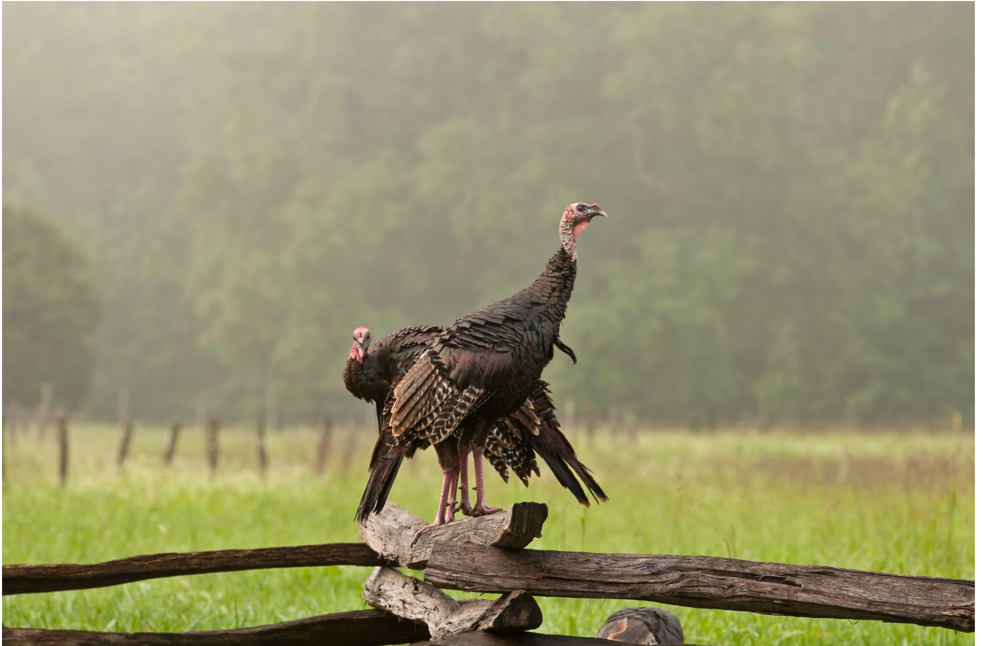
Wild Turkeys in Cades Cove (western valley down from the AT along Mollies Ridge) on a split-rail fence.