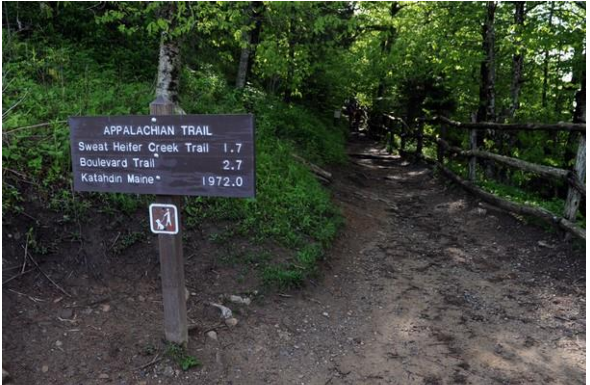
The A. T. leaving the Newfound Gap area and heading northbound