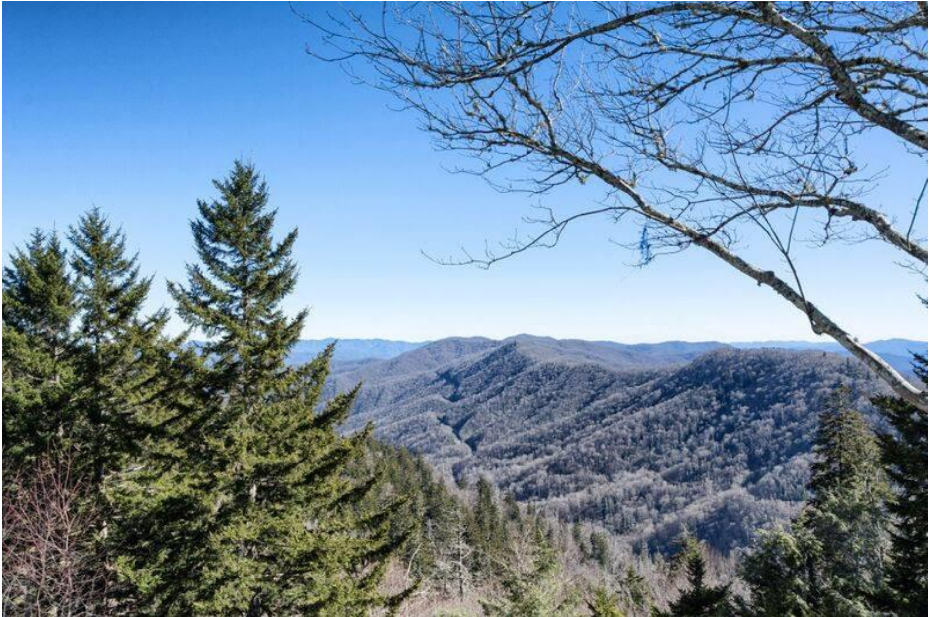
Note Road Scar on Mountain Ridge Going Down to Cherokee, NC in This Newfound Gap A. T. View East