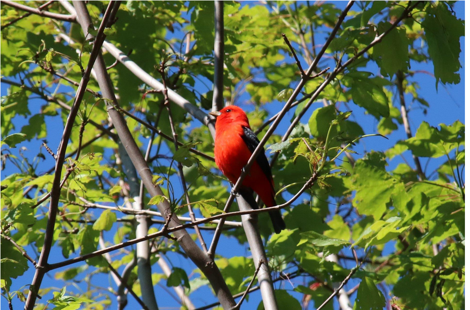
A Scarlet Tanager