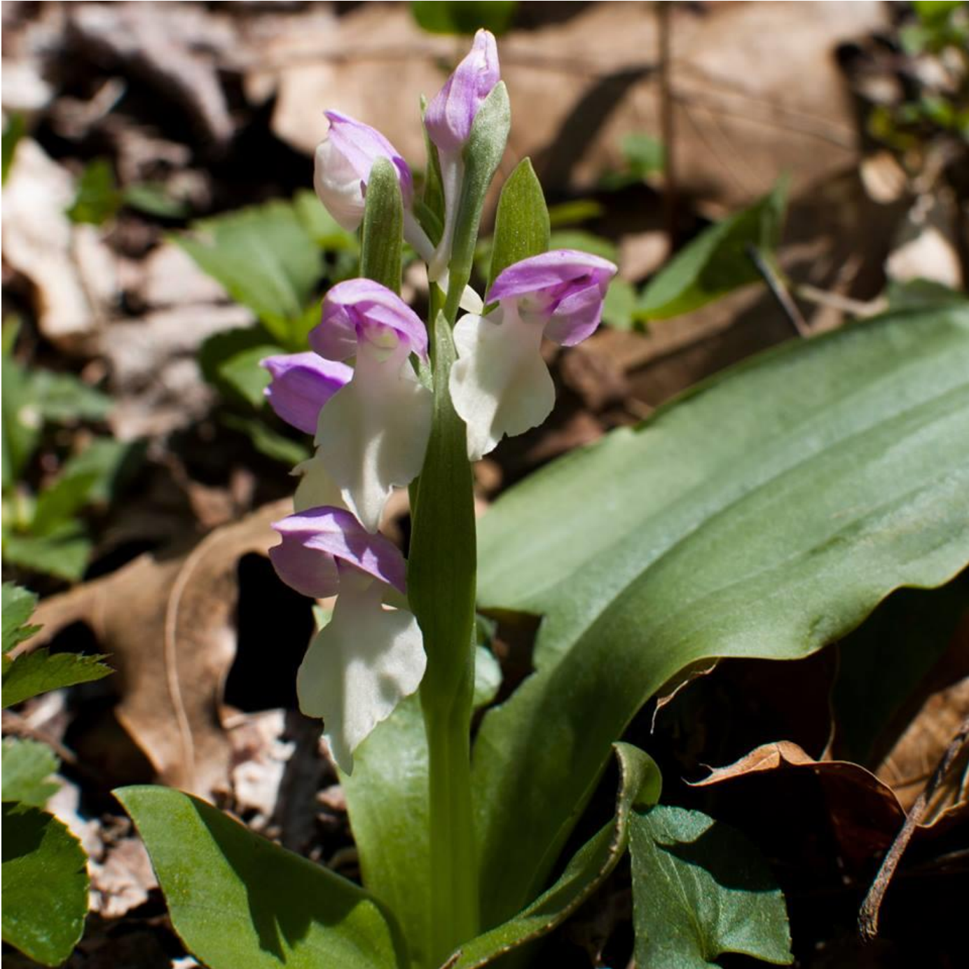
A Showy Orchis ( Galearis spectabilis )