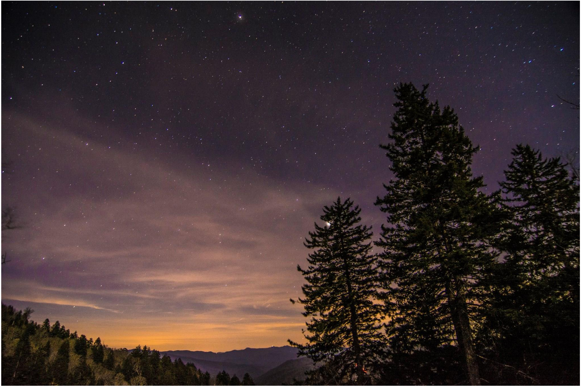
Newfound Gap before Sunrise