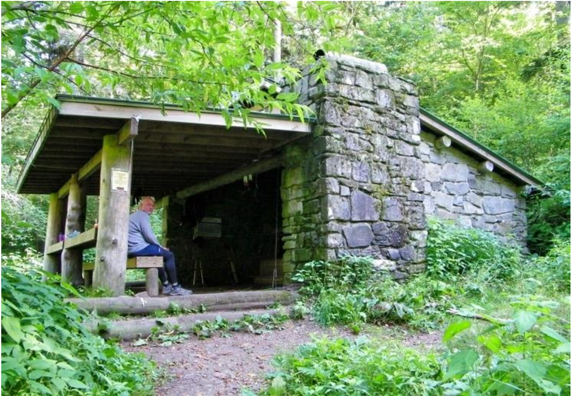
Pecks Corner Shelter, Great Smoky Mountains National Park