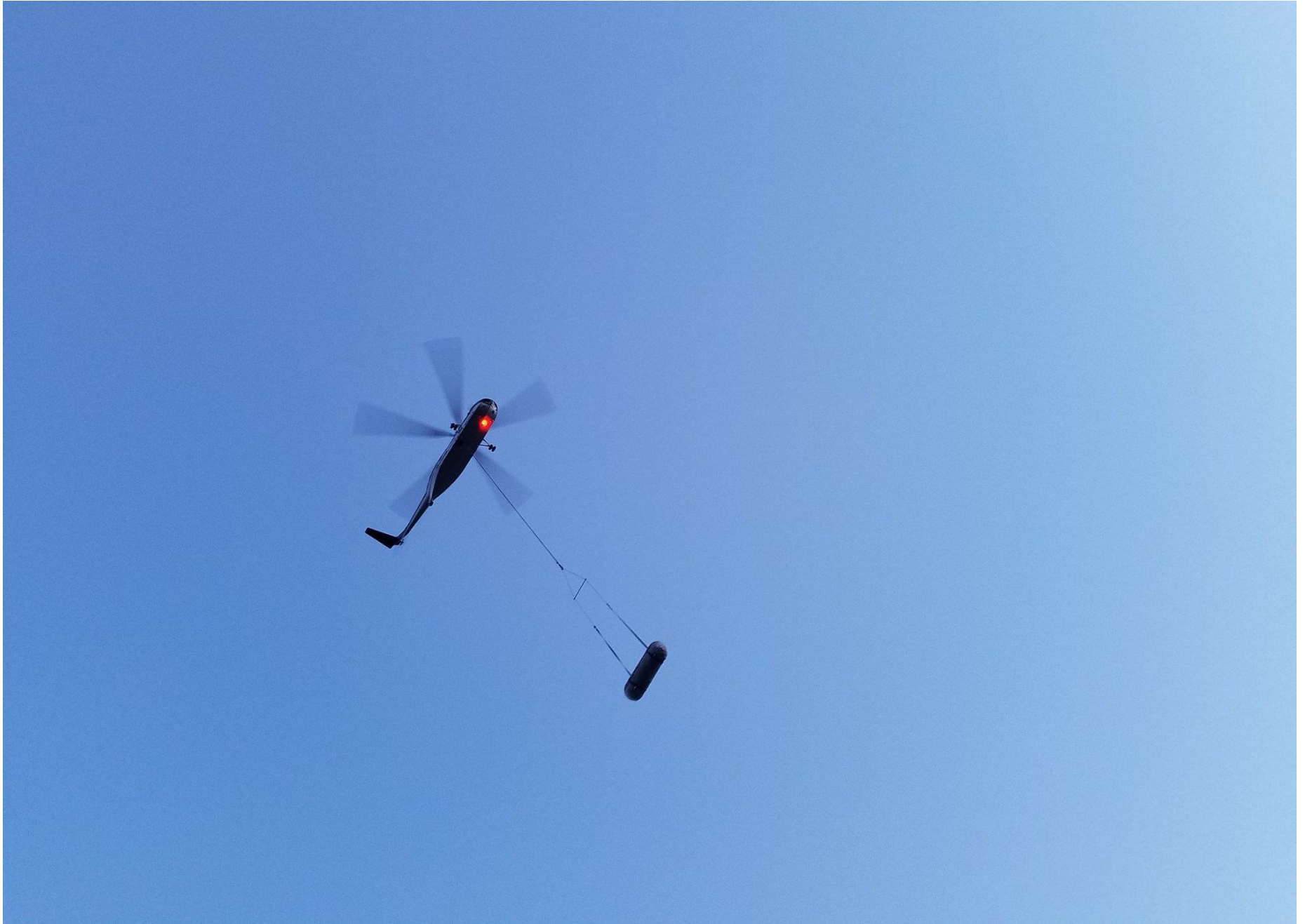
A "Rescue Helicopter"