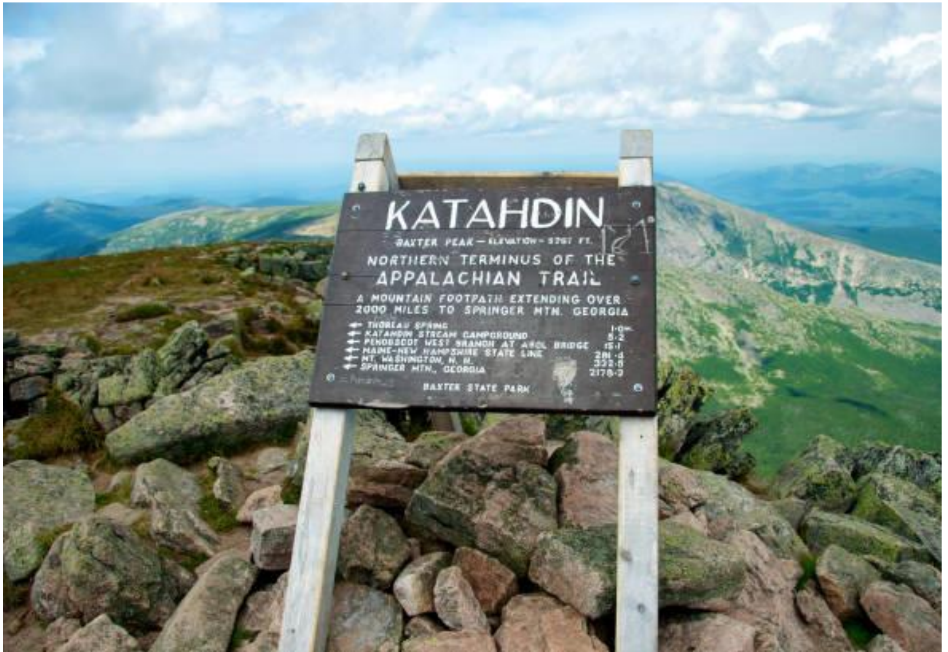
Katahdin's Summit ~ the northern terminus of the A. T.