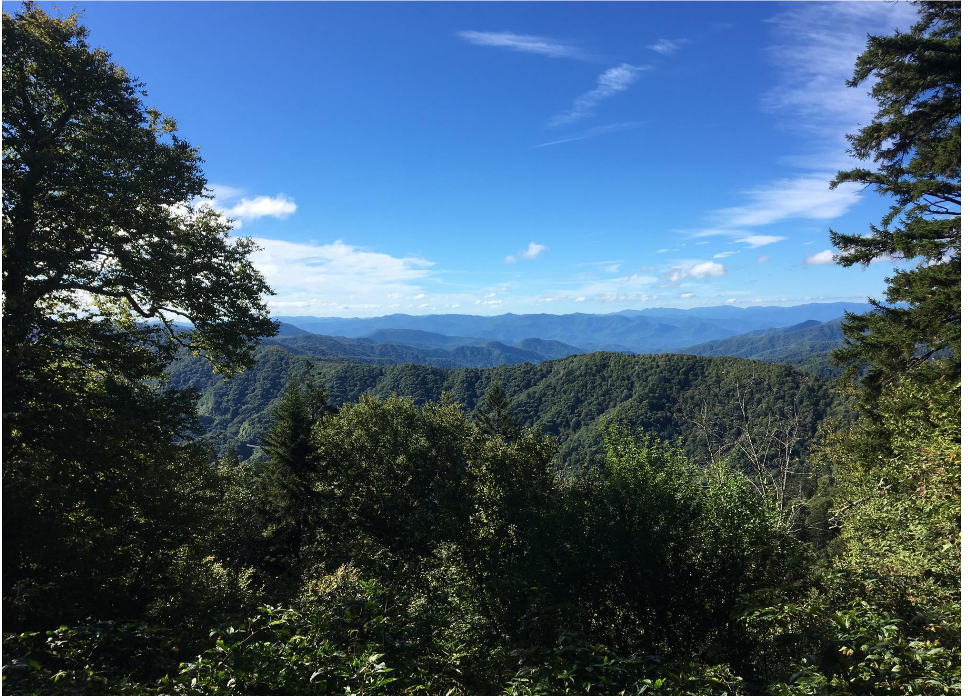
Smoky Mountain View from the A. T.