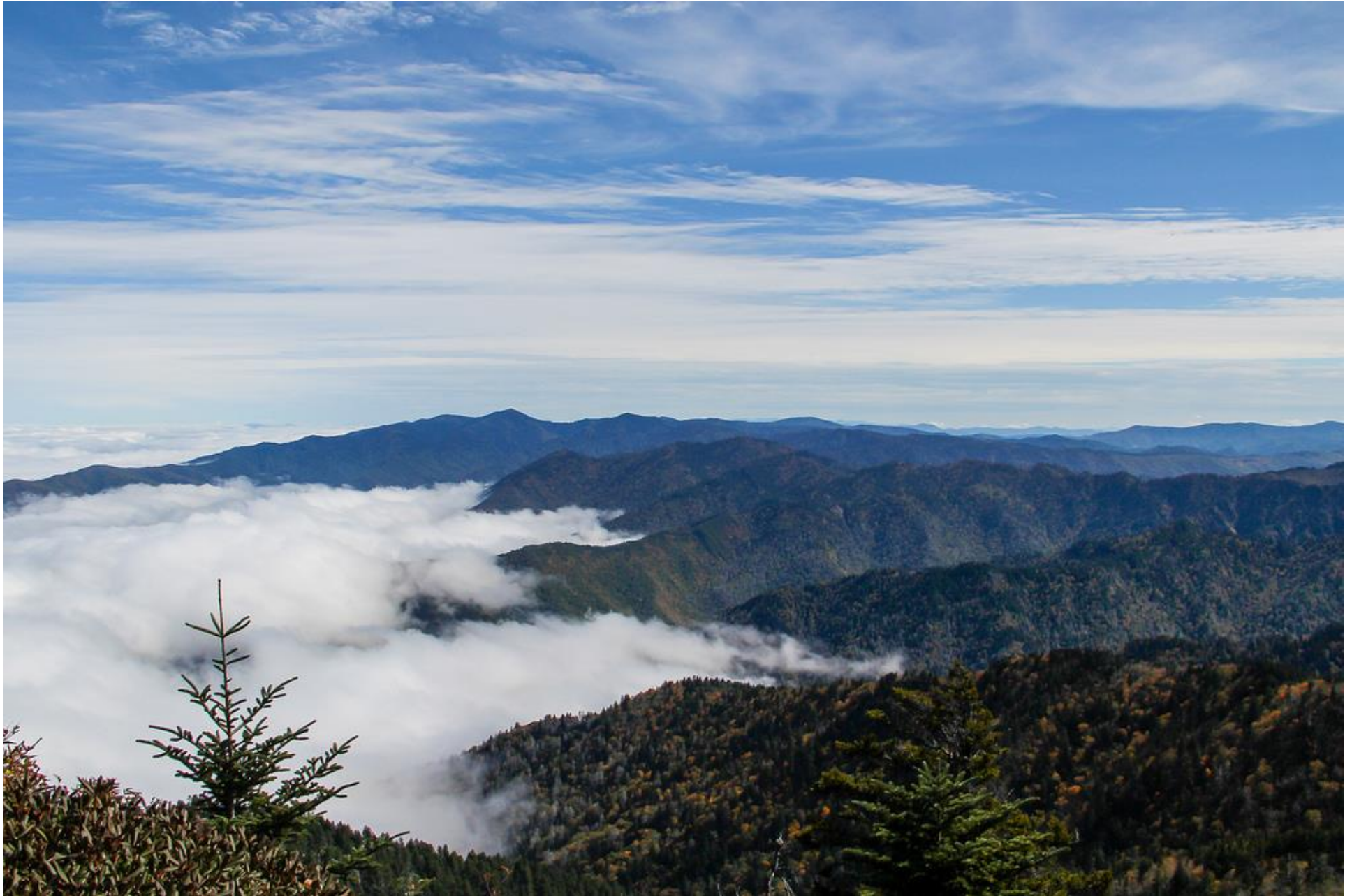
View from Myrtle Point, the eastern cliff top of Mt. LeConte, to the Main Smoky Ridge (middle horizon) ~ the highest mountain of the ridge is Mt. Guyot, then toward the far right the low gap is Newfound Gap ~ thence the ridge rises to the right (west) toward Clingman's Dome (not shown)