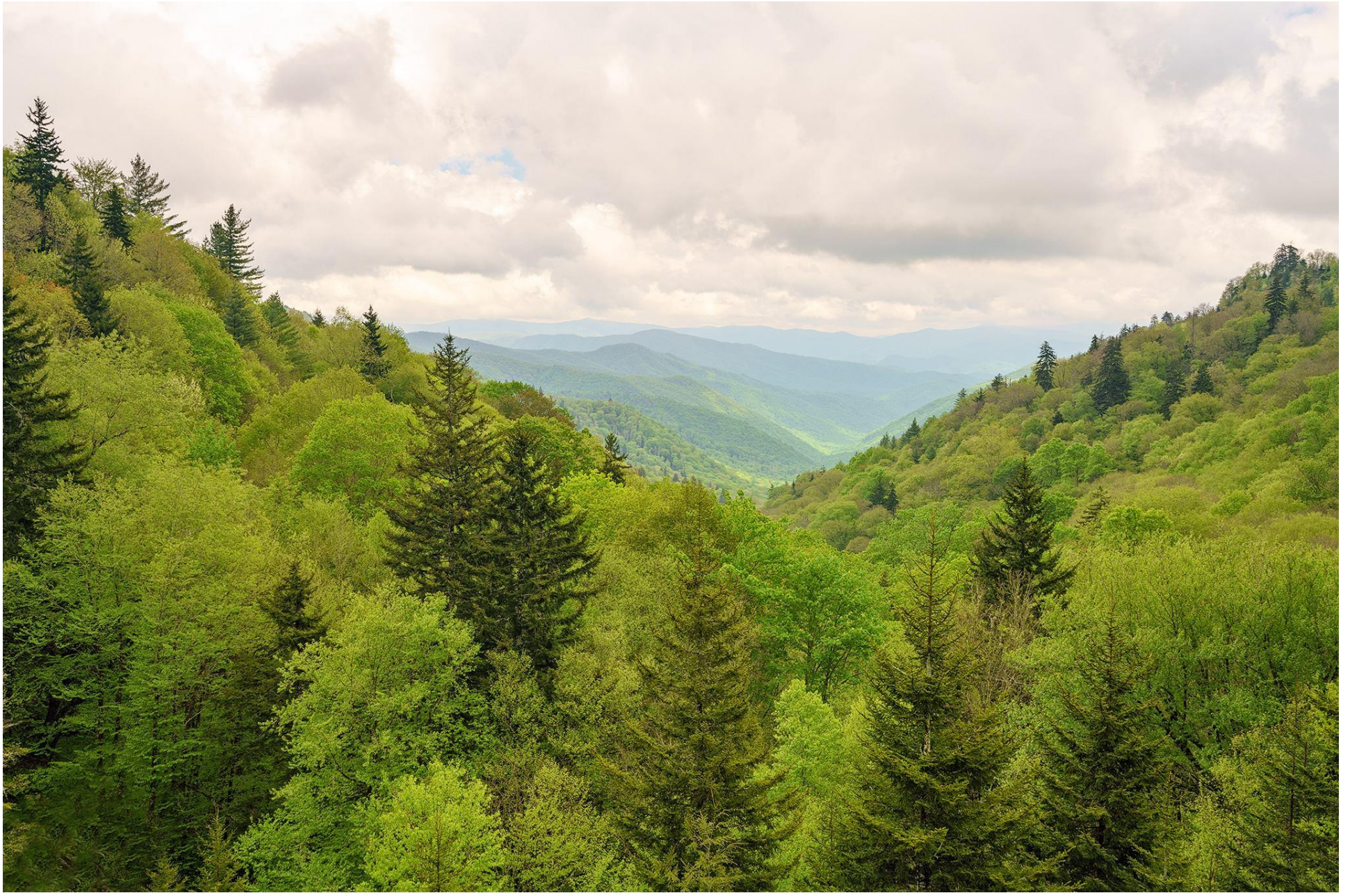
View East Down Towards Cherokee, NC from the A. T. near Icewater Spring Shelter