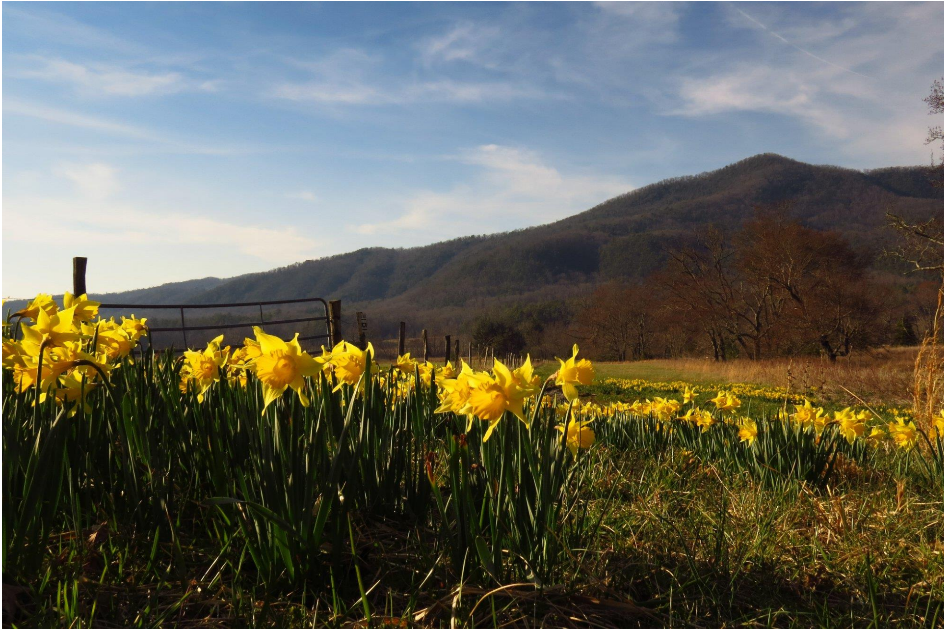
Daffodils Still Grow in Cades Cove Long After Original Inhabitants Have Been Long Gone