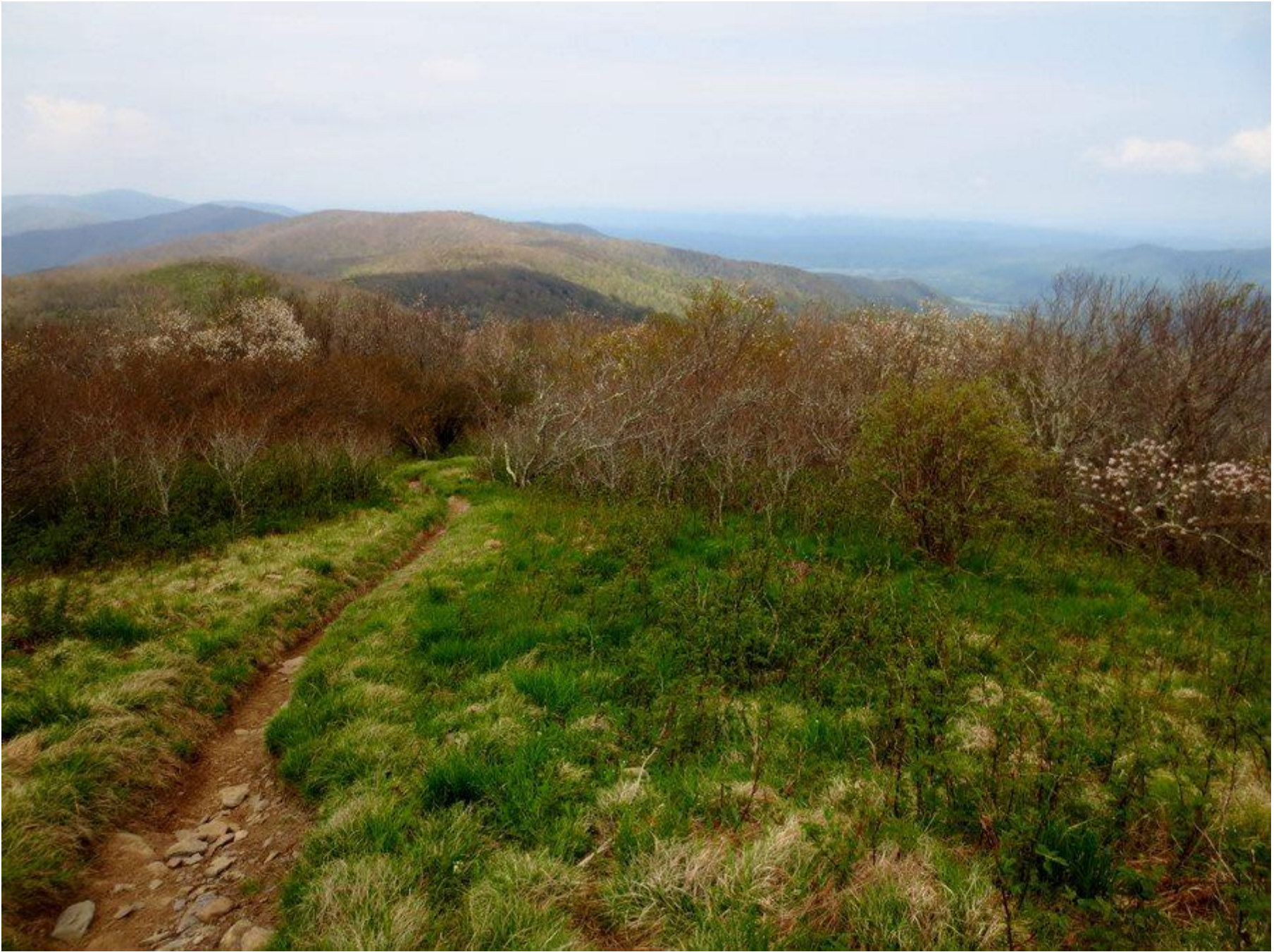
The AT Along the NC/TN Stateline Near Thunderhead Mountain & Rocky Top Mountain