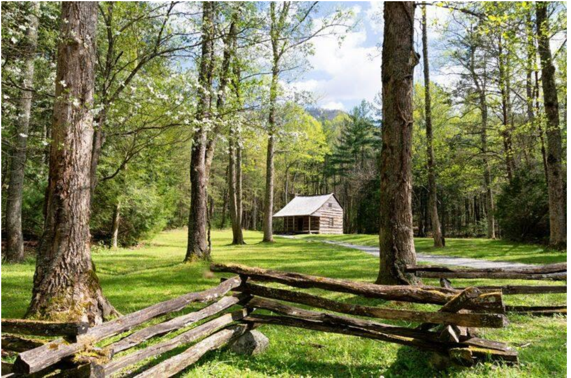
One of Many Log Cabins in Cades Cove (largest collection there of original log cabins anywhere)