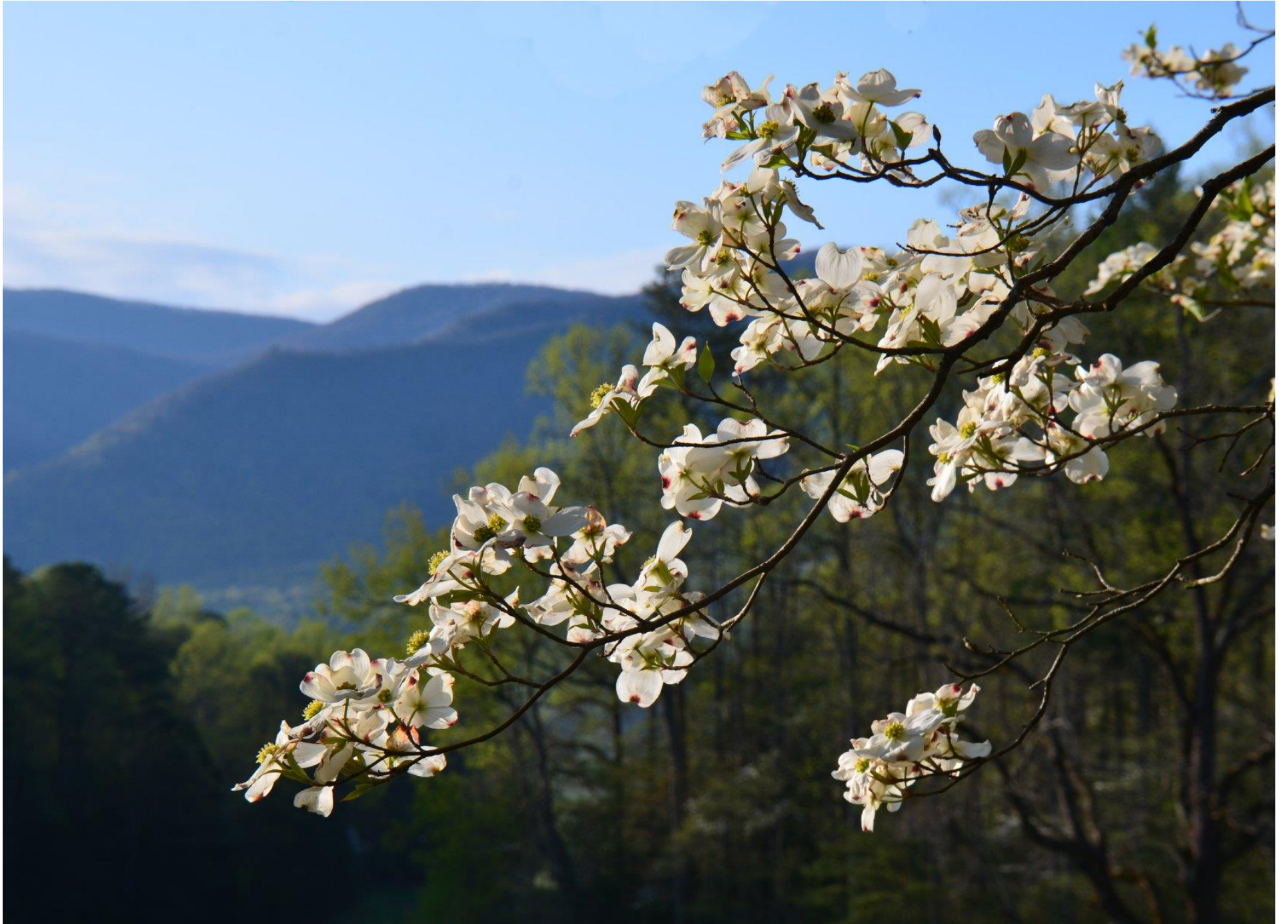
Dogwood Branch in Bloom in the Smoky Mountains