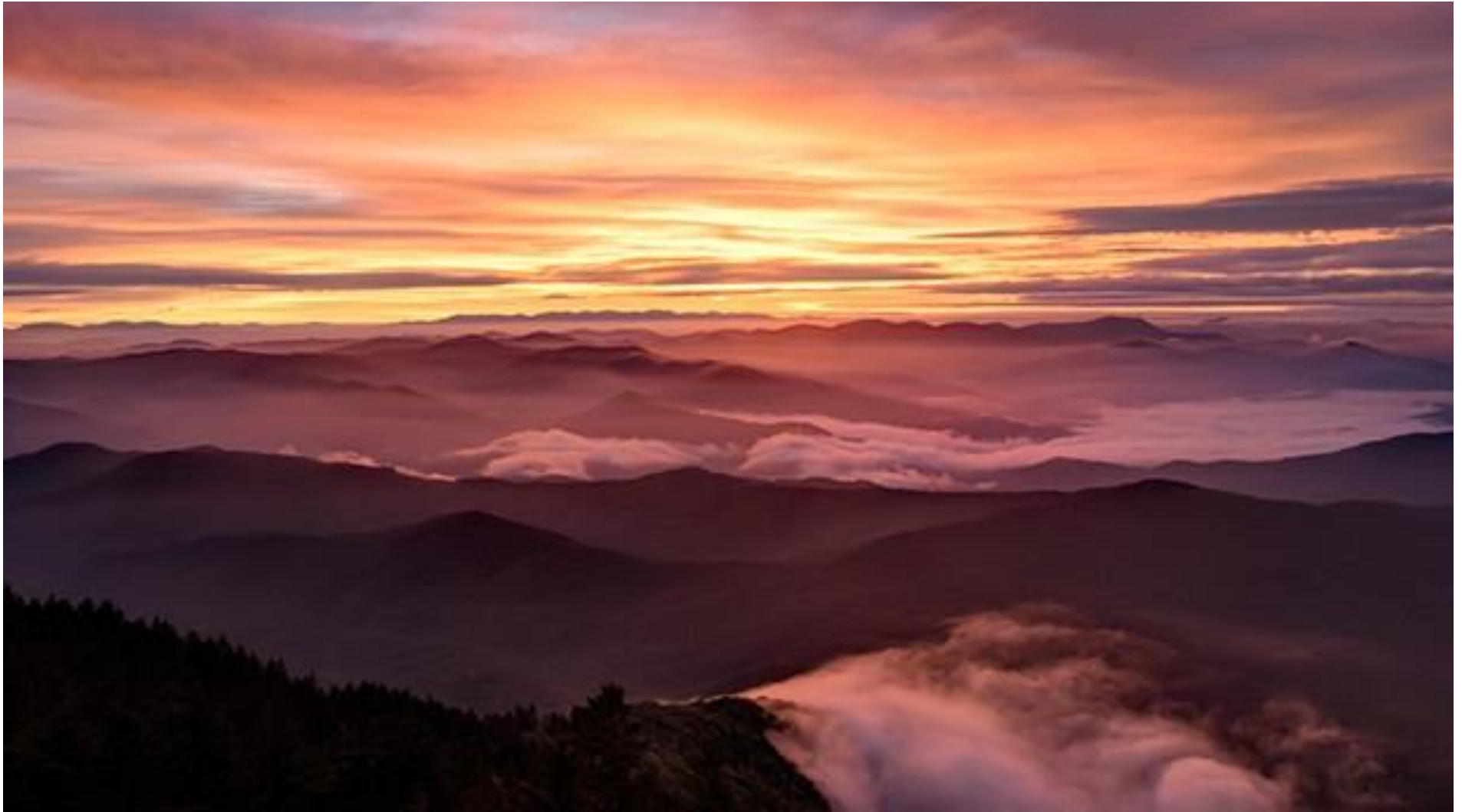
Sunrise from the high ridge in the Smoky Mountains at the Shuckstack Fire Tower