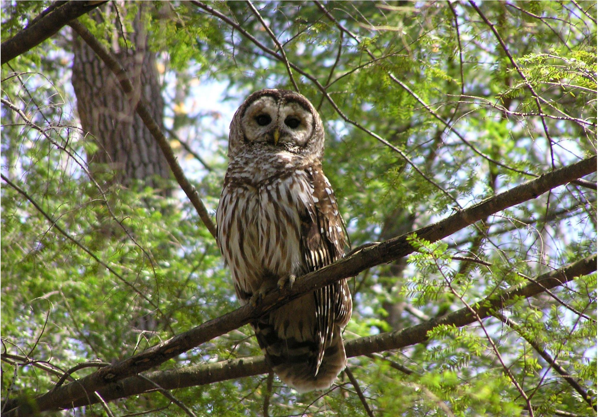
A Barred Owl