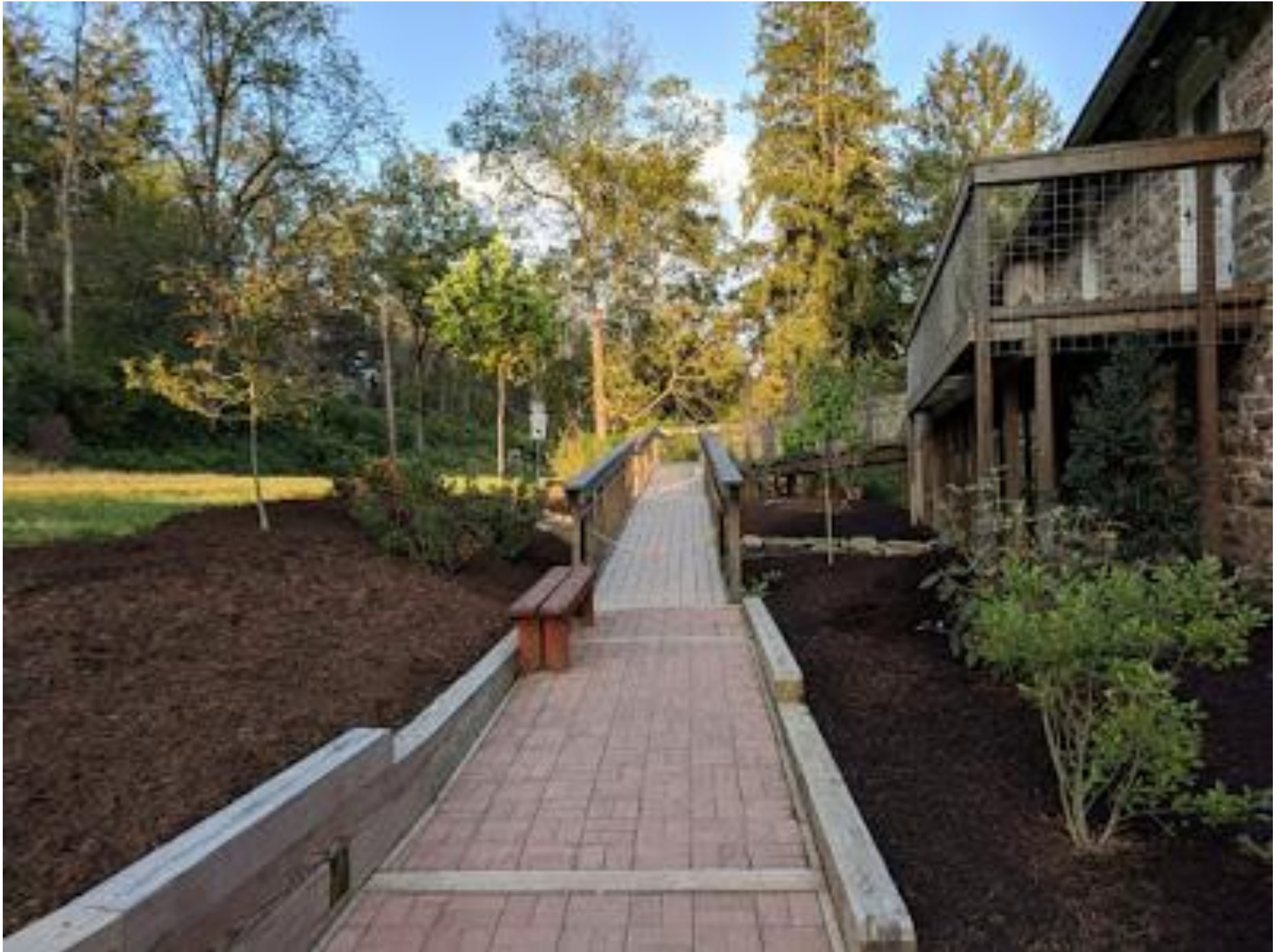
Ramps To Upper Two Levels ~ Butterfly Garden Area